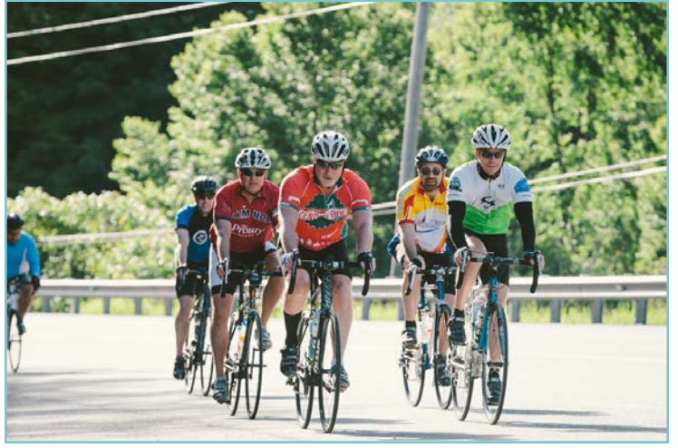
4th Annual Long Trail Century Ride